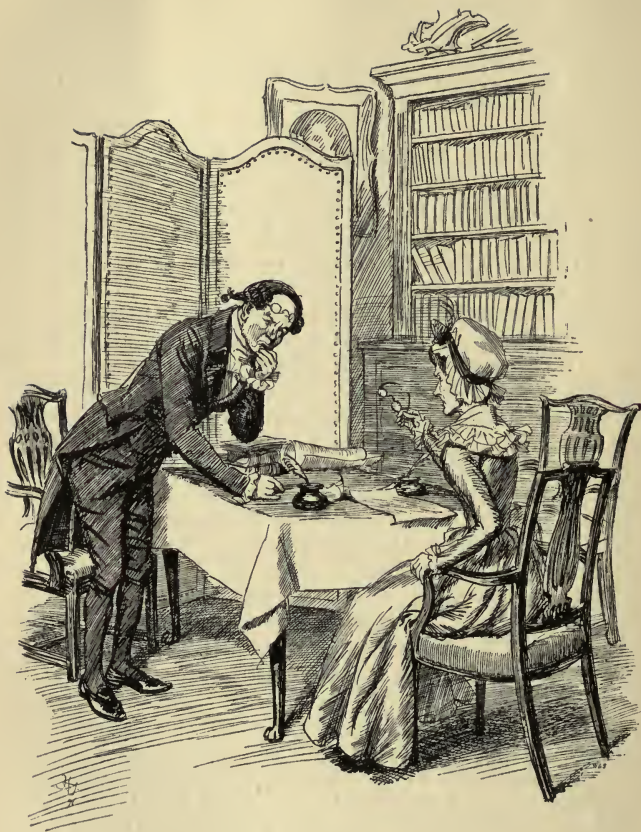
Talking over the business.